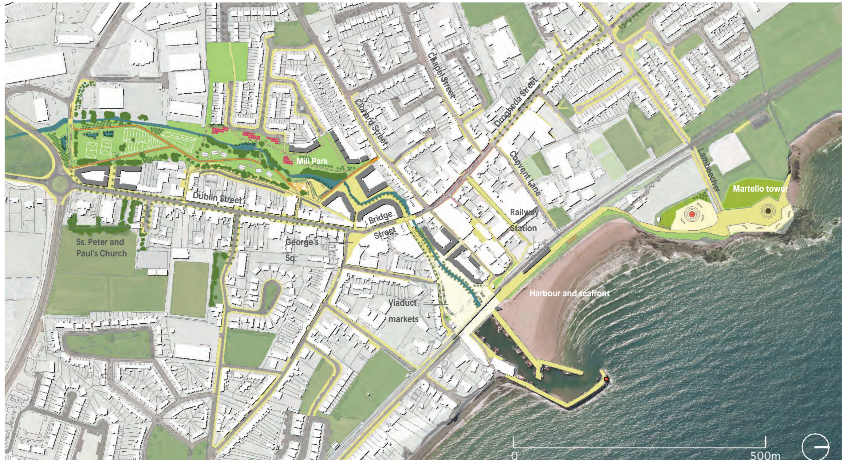
Indicative Public Realm Framework Plan (note: potential for new/ infill buildings is shown in dark grey)

The network of spaces in the strategy is elaborated by an overall street and public space framework plan.