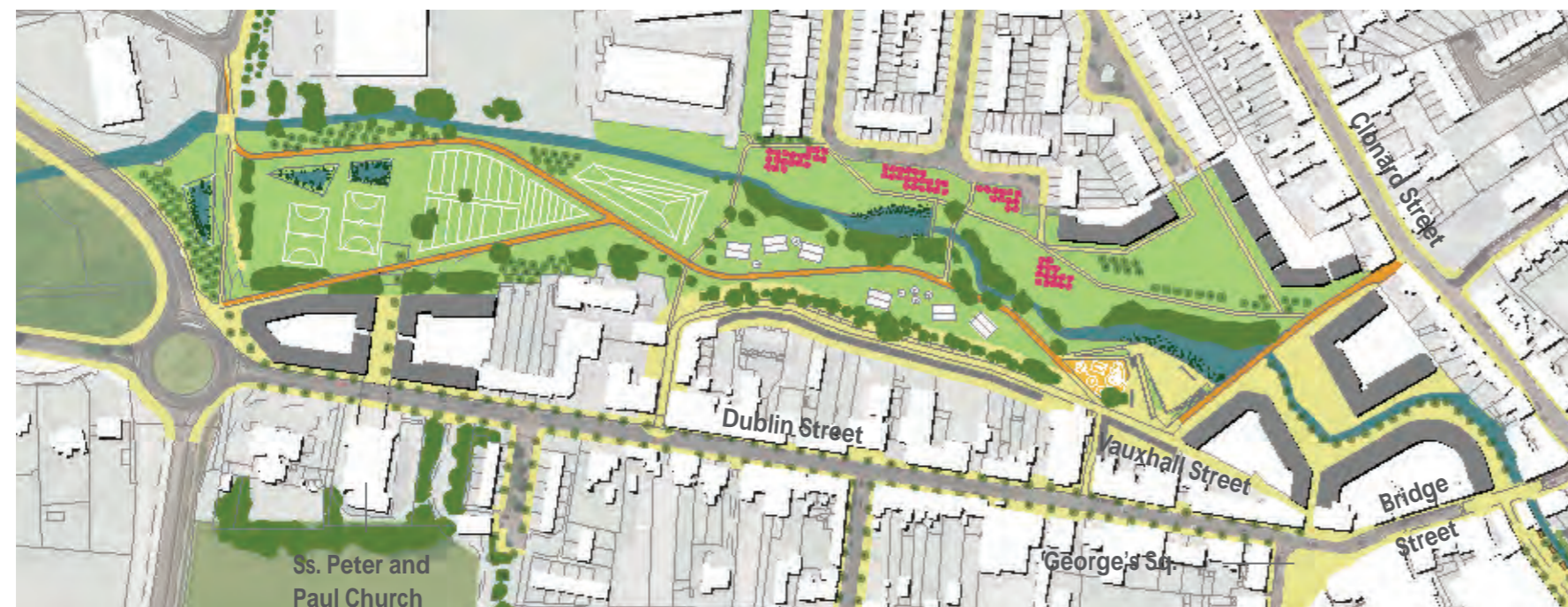
Mill Park indicative design framework

There is further potential to develop the site at Bridge Street where the park meets the town centre, to unblock access and to provide new buildings and uses that have the potential to unlock the park’s potential at this key location. This may involve the creation of new buildings that create a transitional space between softer landscape elements and the more urban character of the town. This transition could be marked by a new weir and walkway upstream from the existing path, incorporating potential for a turbine to generate renewable energy