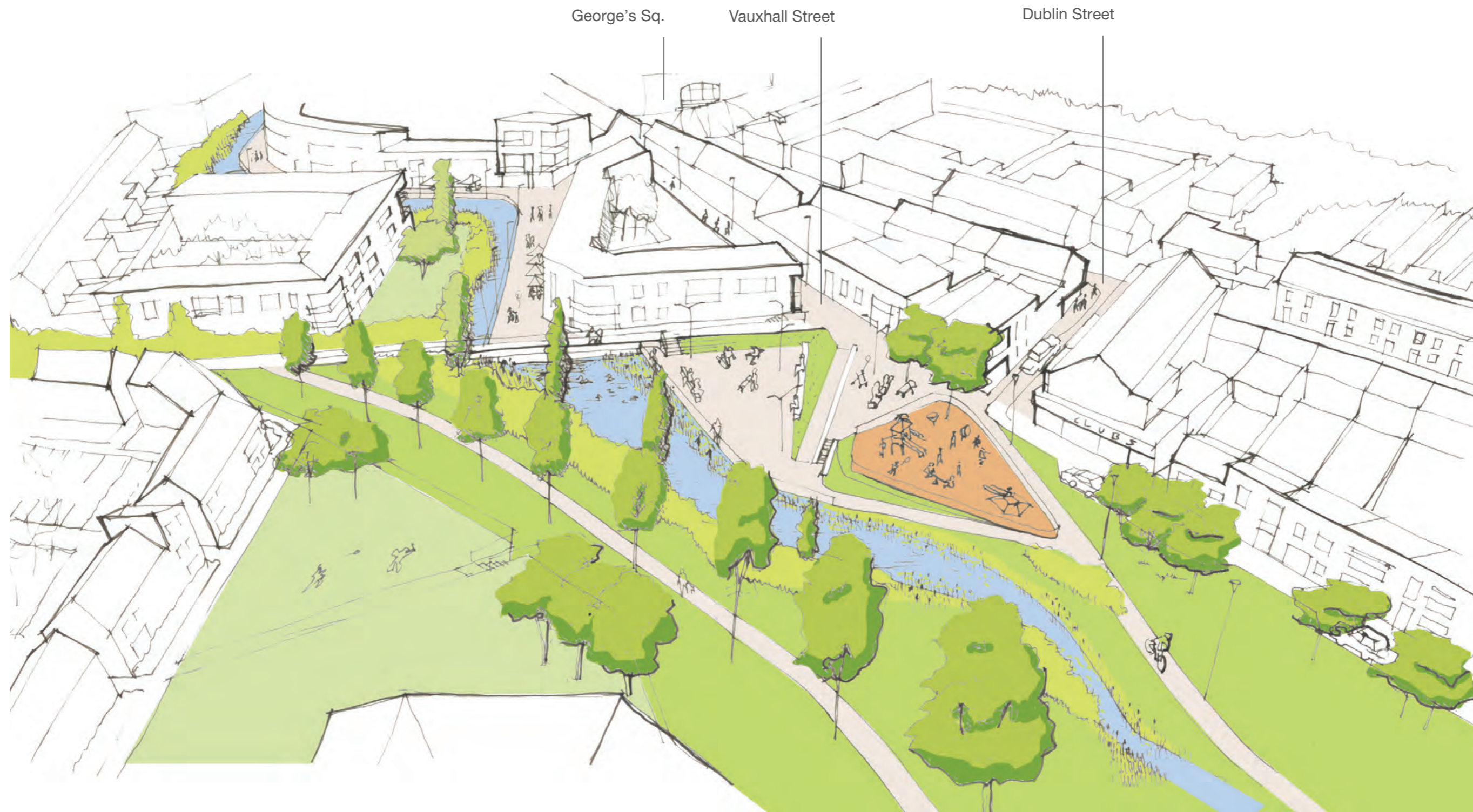
Indicative sketch view of town centre end of Mill Park as envisaged.