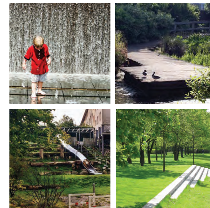
Similar park elements elsewhere

Key proposals for the river and park: Better connections into and through the park; Reintroducing water and managed wetlands; Encouraging infill buildings that will overlook the park and activate its edges; Space for sports and recreation facilities; Unblocking the connection between the park and the town centre at Bridge Street and George’s Square.