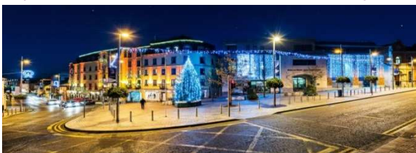
Balbriggan at Christmas

Successful Christmas tree lighting ceremonies took place in Blanchardstown, Swords and Balbriggan. These events had a large attendance, despite the cold weather, across the County.