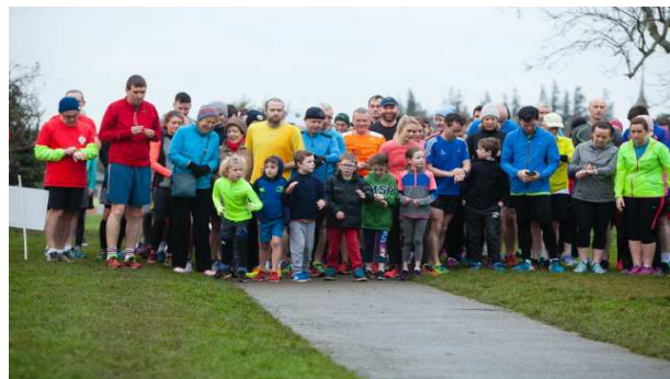
Some of the participants from Operation Transformation 2017

our screens there is a renewed incentive for us all to exercise and improve our health and well-being in 2018.