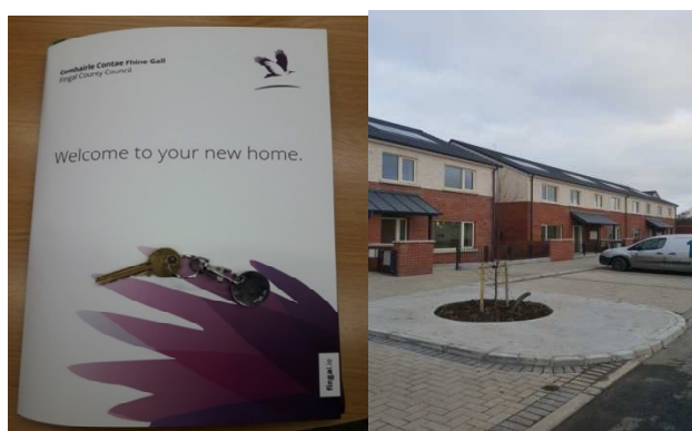
Wellview Terrace, Mulhuddart, Dublin 15

nominations for new homes in the North County and Dublin 15 areas.