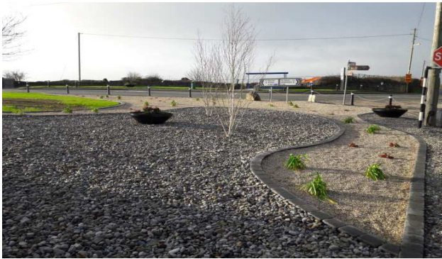
Landscaping works at Loughshinney Crossroads

Below is a summary of other projects from the Works Programme: