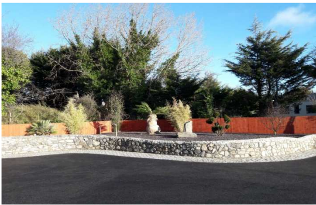
Ongoing works to the Park at The Green, Swords

Footpath Improvement works, including the installation of a knee rail on the old Porterstown Road, which will facilitate greater pedestrian safety for those accessing Scoil Choilm and Luttrellstown Community School, commenced in December.