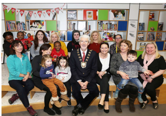
Participants at the exhibition launch at Donabate Library

produced through the House and Home Project. This collaborative project between Sophia Housing Donabate, the Institute of Technology Blanchardstown (ITB) and Fingal Libraries aims to introduce children and their parents to the benefits of books and reading, using a particular theme and a variety of activities. As part of the project, children visited the Early Childhood Care Centre at the ITB, where they engaged in stories, art work and conversation about what house and home means to them.