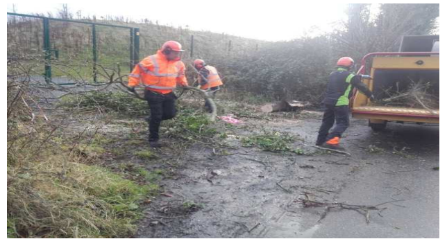
Tree Crew at Rugged Lane, Porterstown, Castleknock removing a fallen tree and debris