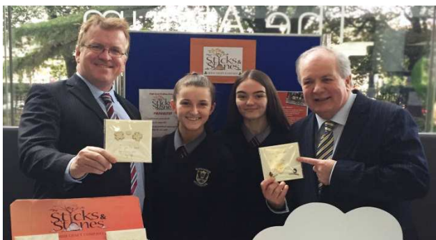
'Sticks and Stones' from Blakestown CS at the Youth Enterprise Market at County Hall in December

LEO Fingal collaborated with Bank of Ireland to host a student enterprise learning event celebrating the vibrant entrepreneurial culture in Fingal. The Fingal Student Enterprise Programme is the largest in Ireland with over 2,500 students participating this year.