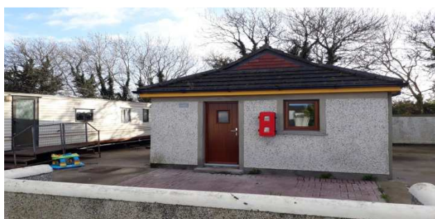
St Macullins Park