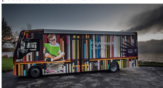
New Mobile Libraries - hitting the roads soon

Three new mobile library vans will be launched on January 23. A fourth van is on order with delivery expected at the end of March.