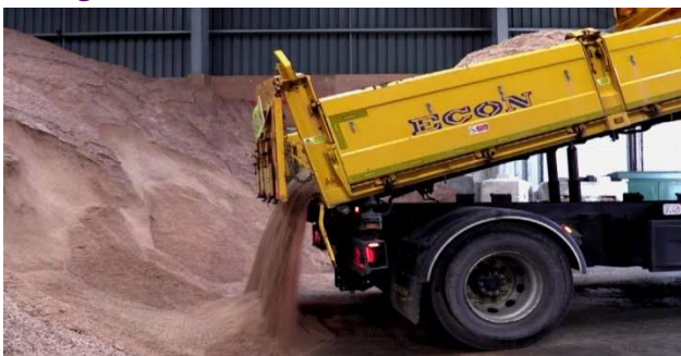
Delivery of salt for winter road gritting

The Council has been active in salting roads across the County during the recent cold weather and will continue to salt roads, when necessary, during the winter months.