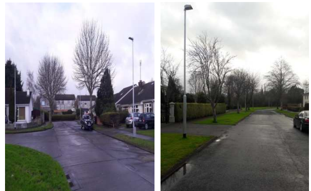
Cherry Avenue Swords

Column replacement works are finished in Cherry Avenue/Park Swords and Georgian Village Castleknock. Works consisted of the replacement of 39 & 65 end of life columns respectively complete with LED lanterns and supply circuit improvement.