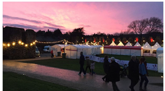
Swords Castle – Christmas Food Fayre

David Gilna, local playwright, performed his play “My Bedsit Window” in Swords Castle from December 4 - 9. This had upwards of 60 people in attendance every night. This is a clear example of the potential of the chapel in Swords Castle as an event space.