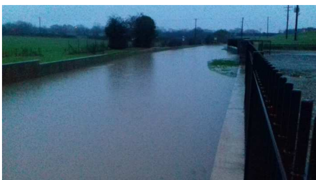
Flooding at Balleally Landfill entrance – November

Tender documents for construction were published on e-tenders issued in December 2017. This project will involve road realignment and drainage works designed to eliminate severe flooding at the entrance, replace surface water and leachate mains and will also involve relocation of facility buildings within the landfill site.