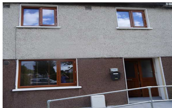
Example of Window & Door Replacement in Dublin 15

The Windows/Doors Replacement Programme for 2017 is substantially complete in Whitestown and Fortlawn Estate, Dublin 15. Installation has commenced in Sheepmore Estate, Dublin 15 and initial surveys have commenced in Dromheath Estate.