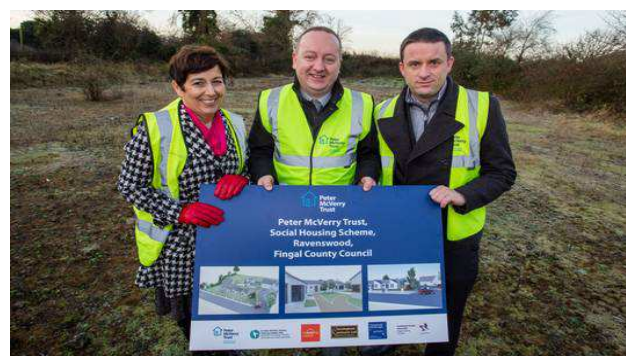
FCC and PMV Trust staff at the Coldwinters' Sod-turning

A new social housing development has begun at Coldwinters, Finglas, through a partnership between Fingal County Council and the Peter McVerry Trust. Six social housing units and a community building will be built on the site at Coldwinters.