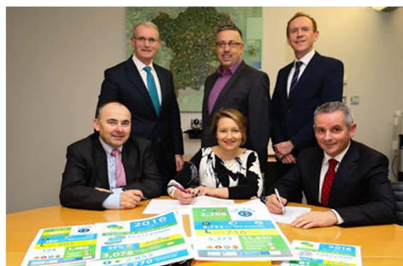
Signing the SICAP contract for 2018-2022

The contract, which will be managed by the LCDC, is worth approximately €6 million and will target those most disadvantaged and socially excluded.