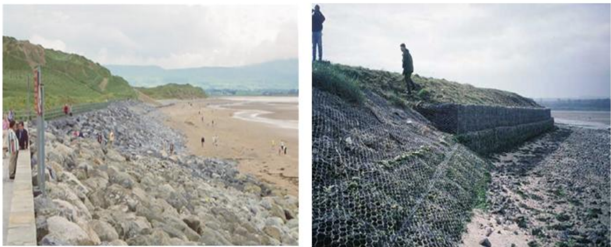
Figure 2: A rock (left) and a gabion revetment (right) providing protection against erosion

Revetments are shore-parallel structures that armour the shore to protect the land behind it against episodic storm-induced erosion and/or longer term erosion by the sea. They can be either impermeable or permeable structures that serve to retain and to stabilize dunes and are generally smaller structure compared to sea walls. Most revetments do not significantly interfere with longshore transport processes. However in the longer term, erosion continues to occur in front of them, this is commonly accompanied by the differential erosion of the dunes at the end of structures.