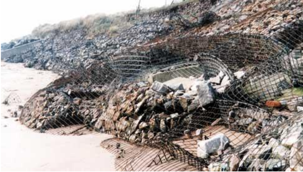
Figure 4: Damaged gabions creating a serious public safety hazard and releasing non-indigenous rocks onto the beach.

In order to prevent differential erosion at the lateral ends of the structure, a rock or gabion revetment would have to extend virtually the full length of the shoreline of Portrane. Considering that at a cost of between €2,000 and €4,000 per metre, the initial capital cost of protecting the shoreline, excluding maintenance would be well in excess of €4 million. It is therefore evident that constructing a revetment to protect the shoreline of Portrane would be economically unviable.