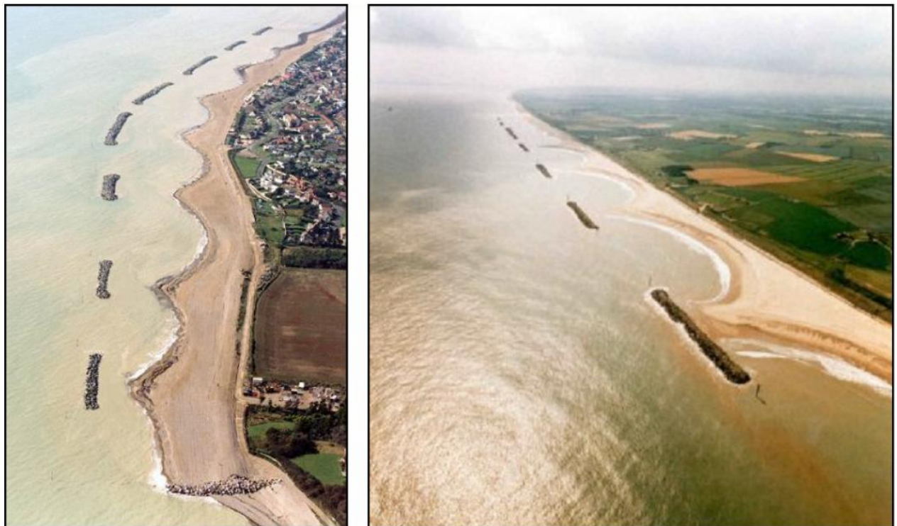
Figure 1: Offshore and shore attached breakwaters

Detached breakwaters can be constructed parallel to the shore as a single structure for localized shore protection or as multiple breakwaters with gaps between the segments for large scale beach protection schemes. In principle, these permanent structures which can be either submerged or emerging refract local wave currents around the ends of the breakwater which builds up the sand in either salient or tombolo formations on the beach depending on the length of the structure and distance from the shoreline in the lee of structure. The effect of the breakwater is that the shoreline behind the breakwater is no longer exposed to the full force of the incident waves.