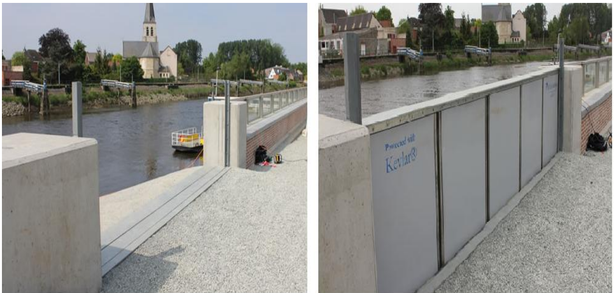
Figure 7: A passive self closing hydraulic barrier used to protect against flooding

Hydraulic flood barriers are primarily designed to mitigate the risk of flooding to ground level or underground structures. Generally, the solid fixed barrier comprises a buoyant composite beam that is engineered to withstand extreme hydrodynamic loadings. The barrier can be operated remotely or automatically - once activated the hydraulic barrier system lifts upward and protects the region behind the defence from flooding (see Figure 7). Typically, hydraulic defences are used around fixed quay structures and wharfs and are particularly effective at protecting against fluvial (river) flooding.