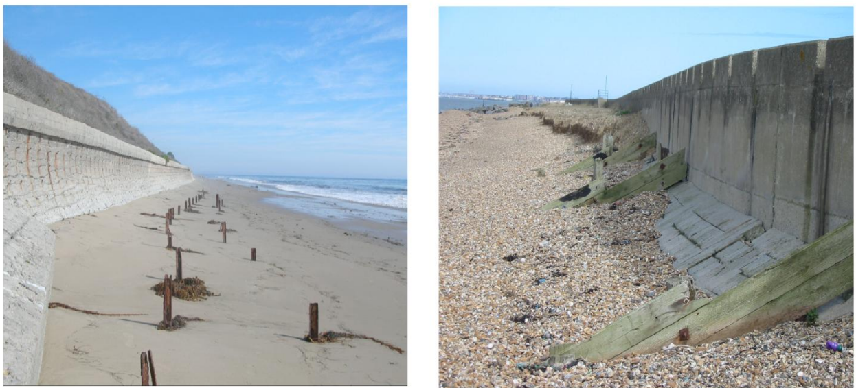
Figure 6: Concave (left) and vertical (right) concrete sea walls providing coastal protection.

A sea wall is a vertical, sloping or concave retaining structure made from either concrete masonry or sheet piles and is designed to protect against heavy wave-induced scour (see Figure 6 ). They are usually built along limited sections of a shoreline as a last line of defence against wave attack, when natural beaches and dunes are too small or low to prevent erosion. A seawall is not built to protect or stabilize the beach or shoreline in-front or adjacent to the structure. Therefore, chronic erosion due to gradients of longshore transport will not be reduced and chronic erosion of the beach in front of the sea wall is likely to continue.