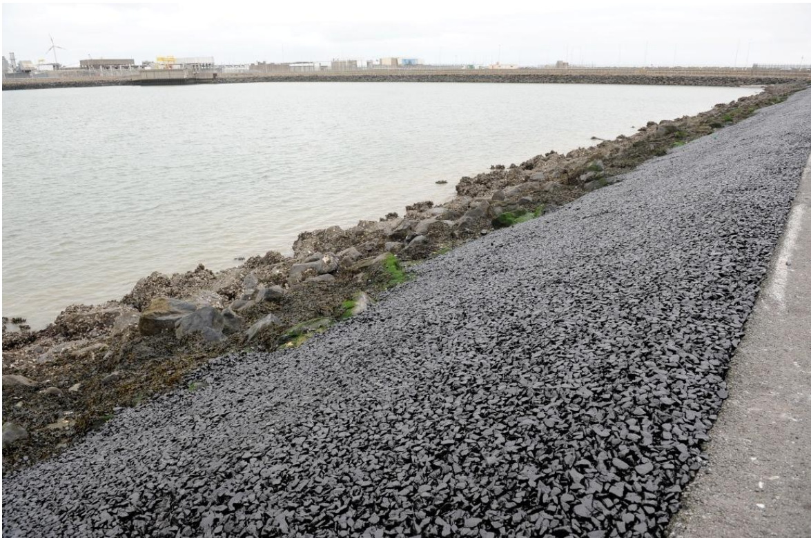
Figure 5: Elastocast bound stone revetment providing coastal protection.

The principles behind this coastal protection system are the same as a stone or gabion revetment, except that instead of being formed from either gabion baskets filled with stone or concrete blocks, this revetment structure is made from stones that are coated in a resin based product known as elastocast. As with traditional revetments, resin bound stone revetments are built parallel to the shore and protect the land behind it against episodic storm-induced erosion and/or longer term erosion by the sea.