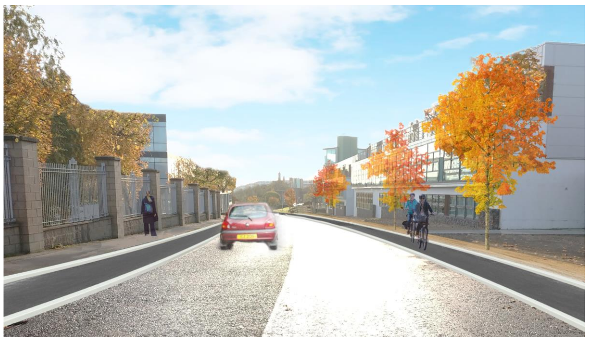
Location 3. Harry Reynolds Road – Chapel Street Junction to Fingal Bay Business Park. The existing trees on the left-hand side would be removed as shown in this visualisation, while the trees on the right-hand side would be newly planted trees replacing the existing trees here.