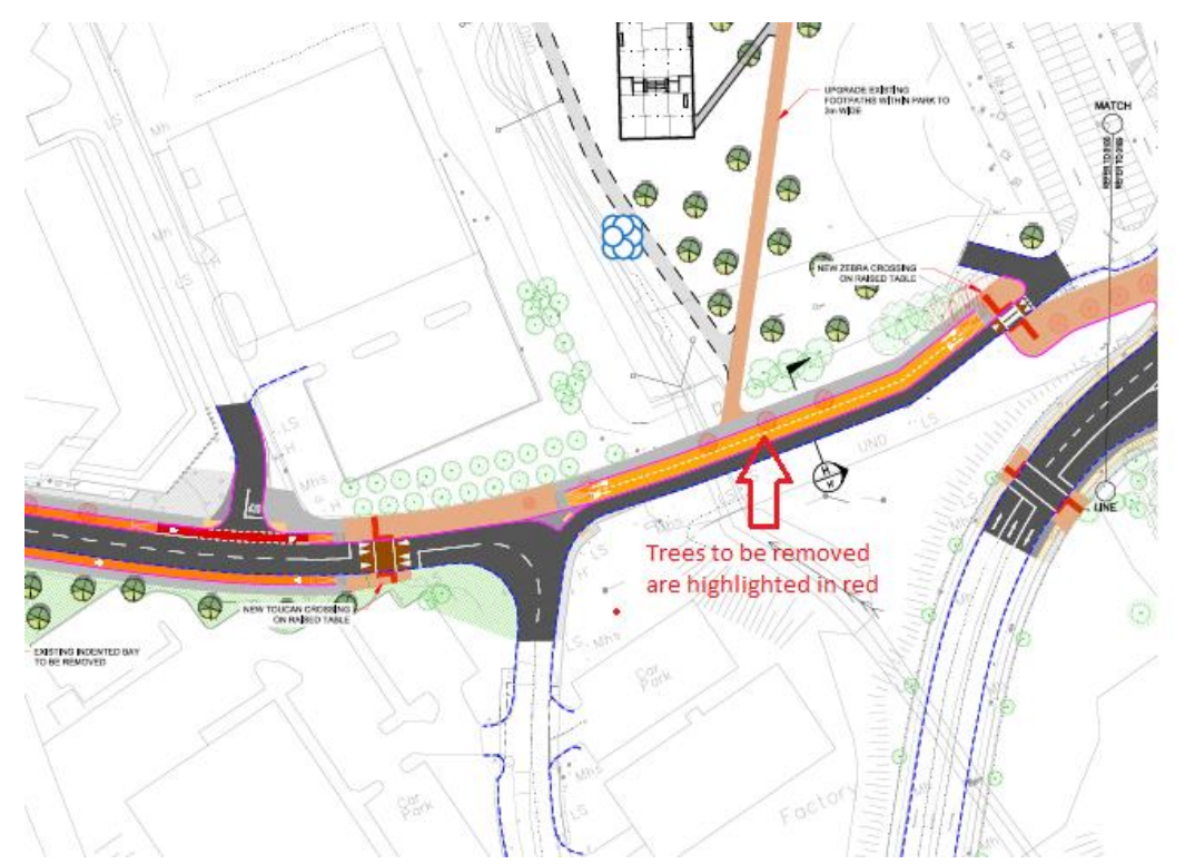
5. Extract from preliminary design drawing sheet 8 of 11 - at exit from church car park