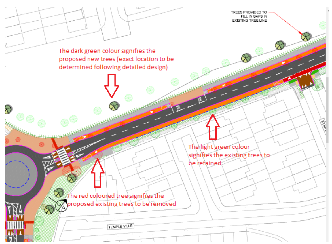
1. Extract from Preliminary Design Drawing sheet 3 of 11 - Section from Roundabout at Ashfield to Drogheda Street

The below extracts are included here to clarify that the proposed trees to be removed are clearly shown on the Preliminary Design Drawings. The trees are also identified and classified in the Tree Survey Report.