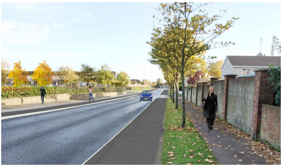
Location 1. Harry Reynolds Road Roundabout to Drogheda Street Junction, looking East. The existing tree line on the south side is maintained, while the existing trees to the North side would be removed and additional trees and hedgerow planted in the open space area adjacent.