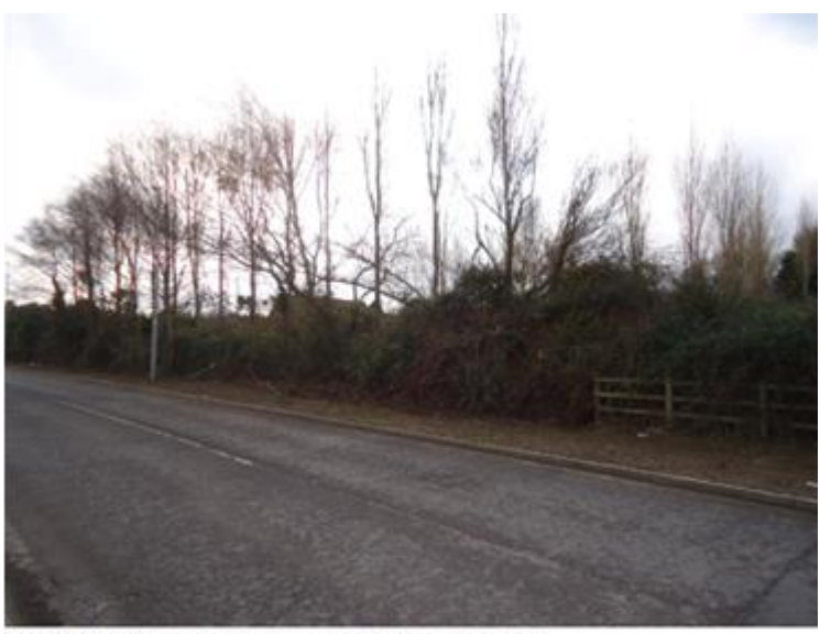
TG46 (looking southwards)

To mitigate this loss and to provide a street tree avenue, new tree planting (21no. trees) is proposed along the northbound carriageway by Fingal Business Park. Once the new planting matures the character of this section of Harry Reynolds Road will improve. Further off-site tree planting (38 trees) will be provided within Millpond Park to further compensate for any loss of trees throughout the scheme.