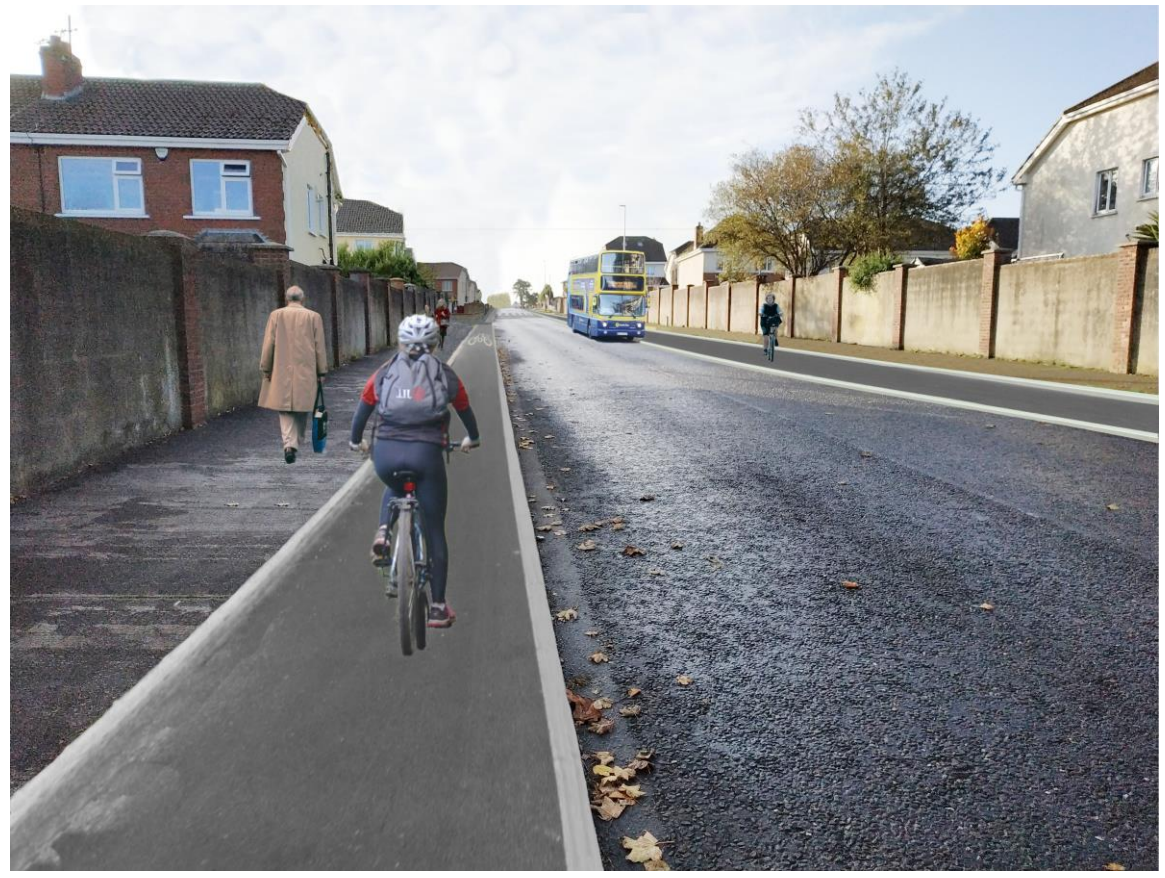
Location 2. Harry Reynolds Road — Roundabout to Chapel Street Junction Trees and grass verge are removed in order to construct safe cycle ways with priority at junctions for vulnerable users. This is the spine of the scheme and maintaining trees here is not possible along the 500m (aaproximate) length section of the route between Ashfield Roundabout and Chapel Street.