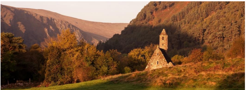
Landscape Photography at Glendalough in Ireland

Put simply, this is the most accurate way of ensuring that you get the maximum sharpness and depth of field possible for the aperture you are using when photographing landscape scenes.