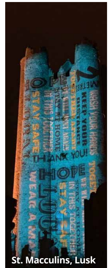
St. Macculins, Lusk