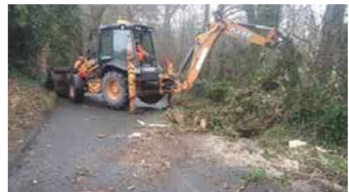
Fingal County Council's Operations crews attended to a large amount of essential and emergency tree works in Dublin 15 following high winds during February.