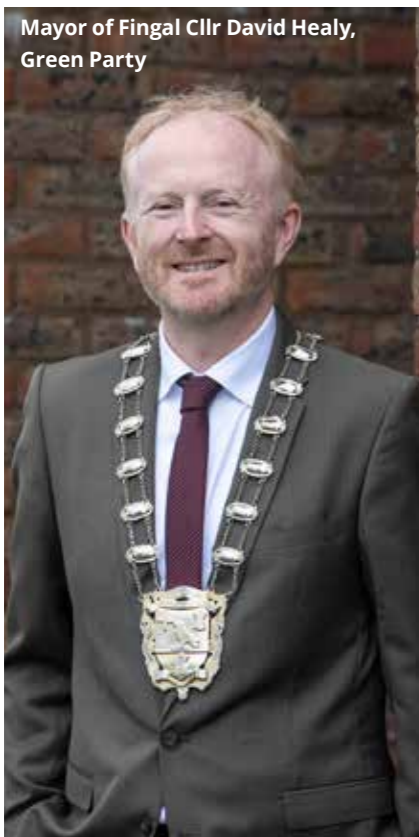
Mayor of Fingal Cllr David Healy, Green Party