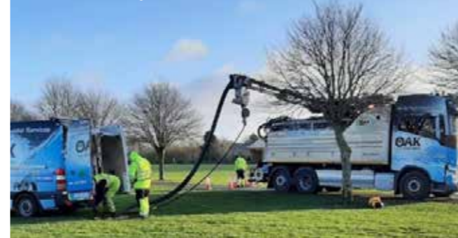
Specialist contractors on site at Ward River Valley Park

Work has commenced on the significant transport assessment element of the Sustainable Swords project. The initial baselines studies are underway, with traffic data collection and review of existing studies ongoing to gain an understanding in more detail of the existing and desired demand for travel in and around Swords. Following that, various interventions will be developed to meet the project objectives. Consultation with the NTA and other stakeholders including elected members and local residents and businesses will form an integral part of this project.