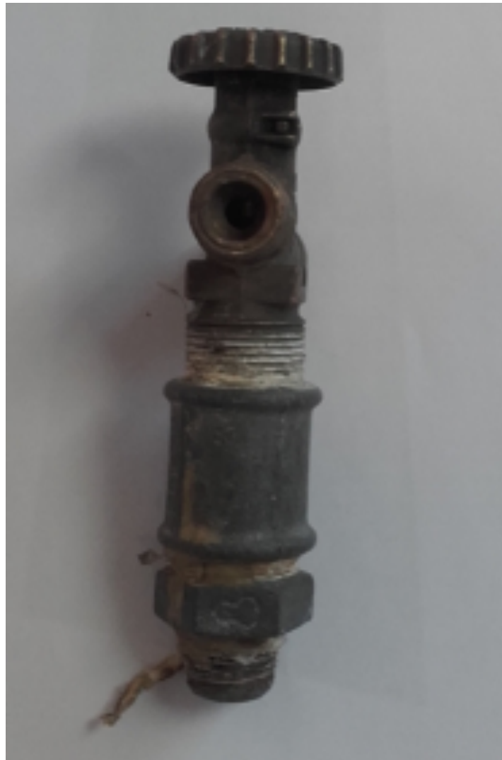
Photograph 5: Turn down valve i.e. screw on H valve.