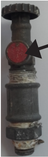
Photograph 8(a): Pressure relief valve

Cylinders shall be fitted with pressure relief valves and an emergency shut off.