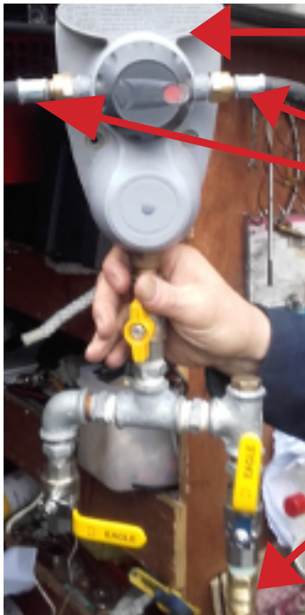
Automatic change over regulator

The low pressure regulator, this safely reduces the high pressure of the cylinder to a lower pressure.