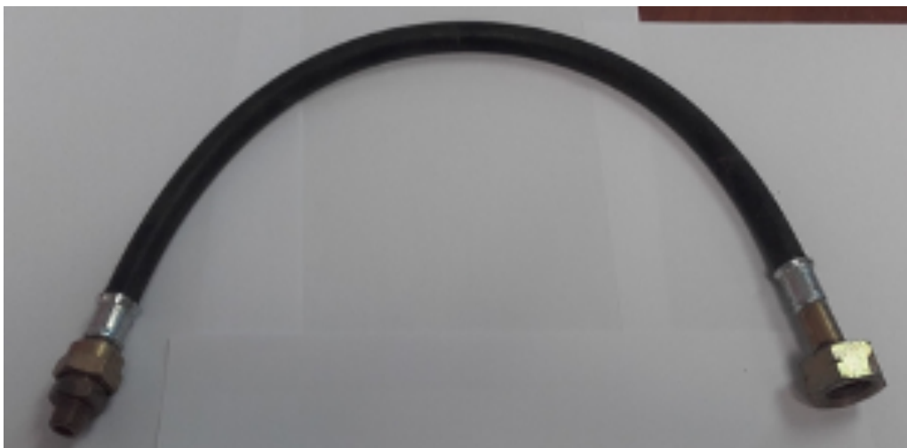
Photograph 2: Pigtail Hosing