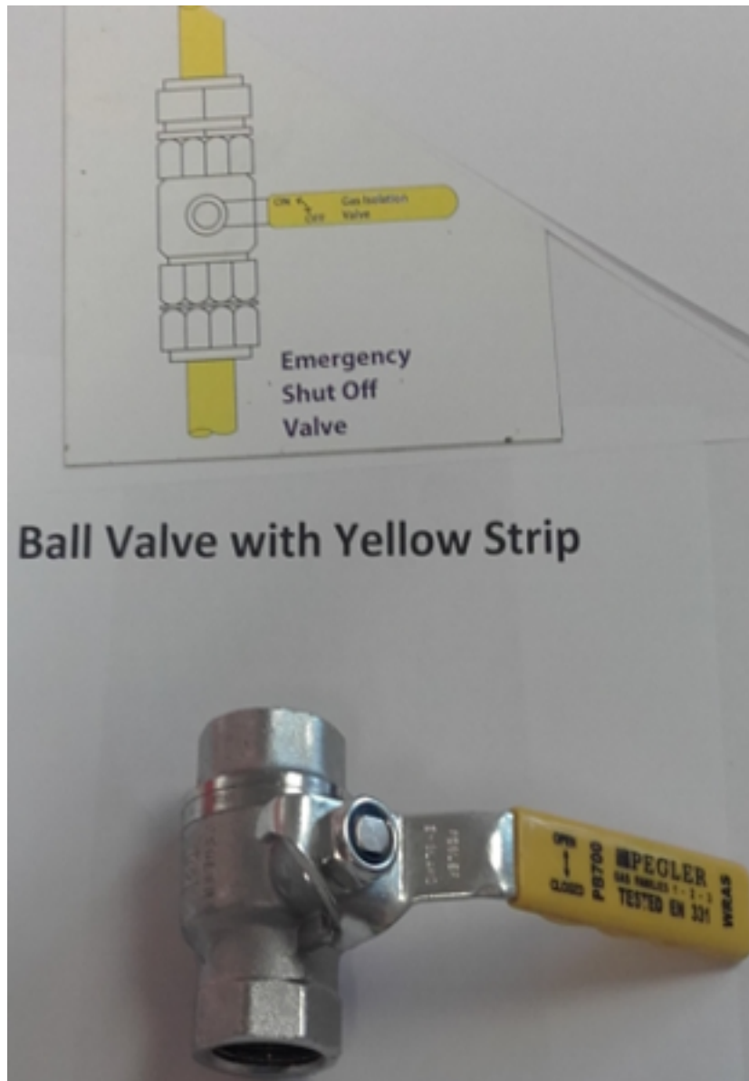
Photograph 6: Ball valves with yellow strip after regulator and before appliance (2 per run serving an appliance)