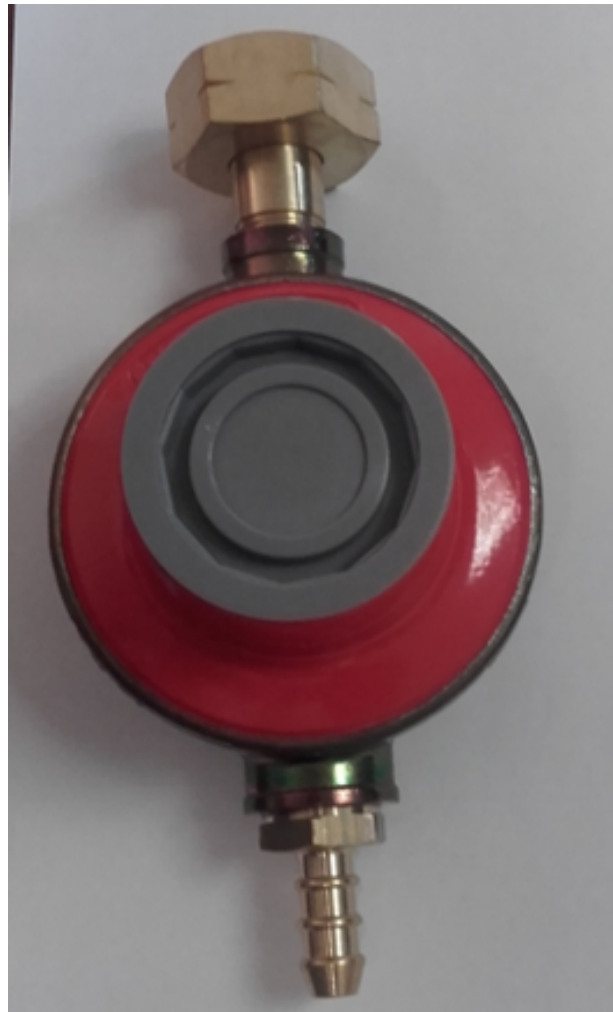
Photograph 1: Regulators