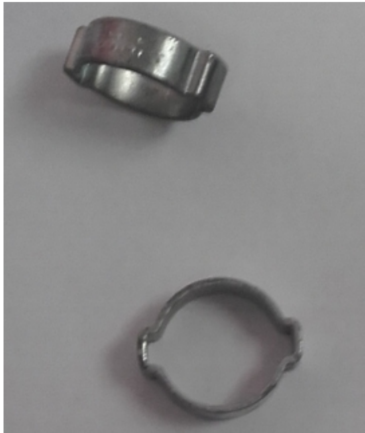
Photograph 3: Crimp Clips