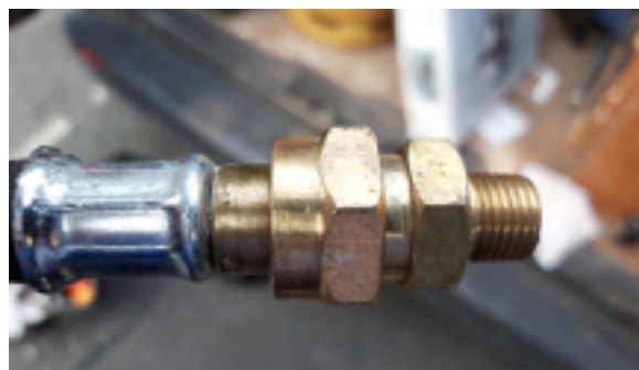
Photograph 7: Non return valves only