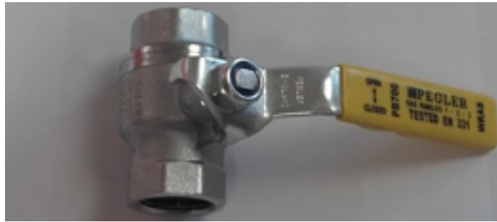
Photograph 8(b): Emergency shut off

The low pressure regulator, this safely reduces the high pressure of the cylinder to a lower pressure.