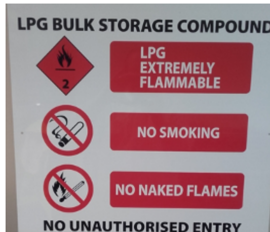
Photograph 10: Safety Sign

A suitable notice shall be fixed to the outside of the cylinders cage to warn of the presence of gas. The sign shall indicate “highly Flammable, “no smoking”, “Use Caution” and to “keep the area clear”. [O.1.3 of I.S. 820 2019]