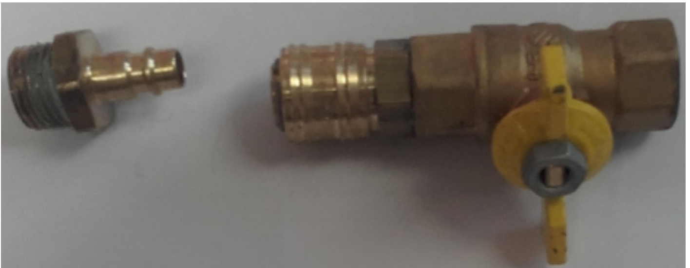
Photograph 4: Bayonet connections all points i.e. plug and play