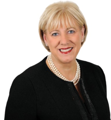
Heather Humphreys, T.D.

Our public libraries are at the heart of our communities. Libraries offer a vast range of services, both in-person and online, to library users, young and old. Supporting libraries has been a key priority of mine as Minister for Rural and Community Development. I am therefore delighted to welcome this new public library strategy, The Library is the Place: Information, Recreation, Inspiration , which sets out 66 strategic actions under 9 strategic objectives and 3 strategic enablers for our public libraries, for the next five years.